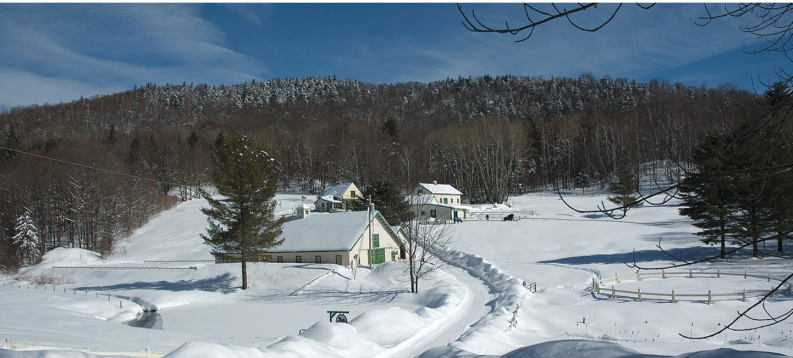
Our mountainside studios in VT

It was handcrafted for you by our talented artisans here in Vermont.